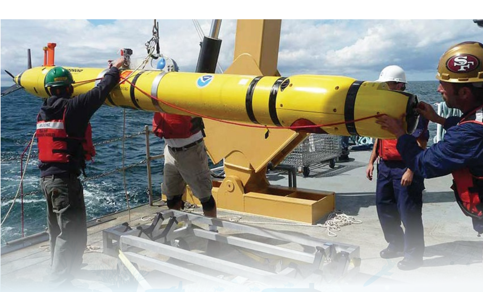
NOAA Ship Ferdinand R. Hassler crew recover the Office of Coast Survey's Hydroid REMUS 600 UUV after completion of a bathymetric mapping mission. This vehicle can operate for 20+ hours at depths up to 450 meters while maintaining acoustic communications with the host ship.