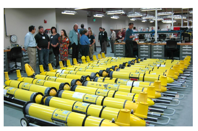
NOAA's U.S. Integrated Ocean Observing System Program partnered with the U.S. Navy and Shell Oil Co. to share data from over 20 gliders deployed in the Gulf of Mexico in 2018. Salinity and temperature data from gliders can improve hurricane intensity forecasts.

Formal concepts of operations (CONOPS) describing UxS operational applications to NOAA mission priorities will ensure efficient and reproducible operational methods, including flexibility to adapt and align to potentially radically different approaches like working beyond line-of-sight or operating swarms of platforms. CONOPS may also describe allocation pools to share UxS assets similar to provisioning of NOAA ships and aircraft to help ensure the greatest number and highest priority of mission requirements are satisfied. Integrating these diverse operational modes into an overall NOAA UxS CONOPS will improve consistency of operations, and provide a template for partner organizations. The CONOPS will include language that states NOAA will operate UxS assets in a safe and secure manner in compliance with all relevant environmental laws, ensuring that operations do not interfere with individual privacy rights or adversely