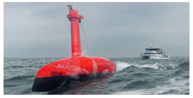
NOAA's Office of Coast Survey and the University of New Hampshire's Center for Coastal and Ocean Mapping/Joint Hydrographic Center are working with iXblue to evaluate the "DriX" USV as a force multiplier by working in tandem with research ships to increase rates of ocean-bottom mapping.

Partnerships with industry to research and develop the design and use of UxS is a key provision in CENOTE and can be expanded through multiple mechanisms. These include CRADAs, increased use of NOPP, Small Business Innovation Research grants, contracts, crossagency agreements, and other vehicles as appropriate to increase and accelerate collaborations, support commercialization, assist with assessments of commercially available UxS, and participate in cooperative investigations. Iterative demonstrations and field trials of industry technologies, and evaluation of acquisition alternatives, e.g. government owned/operated, industry owned/operated, leasing, and data or product buys have proven successful and important. Through these collaborations, NOAA will also grow advocacy and awareness of UxS mission priorities.