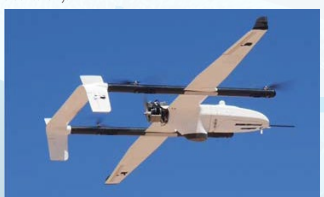
The L3 Latitude is a hybrid quadrotor UAS that combines vertical takeoff and landing with the speed and range of a fixed-wing aircraft. NOAA is testing it for launching from a ship for climate and air quality studies, fishery and mammal surveys, weather observations, oil spill detection, and post severe weather damage assessments.

To ensure the NOAA Uncrewed Systems Strategy realizes transformational advances in performance, skill, and efficiency, NOAA is developing a companion UxS Strategic Implementation Plan or "Roadmap" that will define detailed action items, deadlines, and responsibilities scaled to potential available funding levels. Meanwhile, NOAA's use of uncrewed systems is already significantly improving performance in our lifesaving and economically impactful missions, and setting the course to strengthen our renowned environmental science and technology leadership for the coming decades. Together with our advances in NOAA's other science and technology focus areas—Al, 'Omics, and Cloud Computing—NOAA will achieve our top agency priorities to regain global leadership in numerical weather prediction and sustainably expand the American Blue Economy.